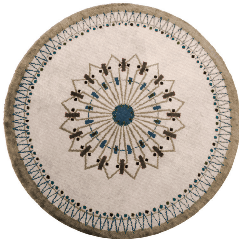
ASTRE - BEIGE