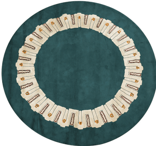
FRESQUE - PLUME DE PAON