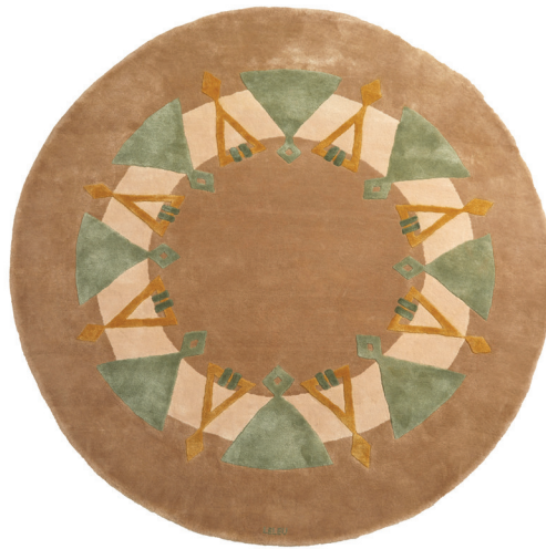
JOYA - BEIGE, OR & AMANDE