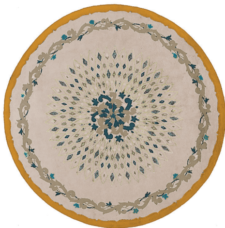
ROSACE - BEIGE KYANITE